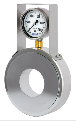
Hydraulic ring force transducer, model F6137